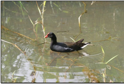
Common Gallinule 'Alae 'ula