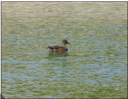
Hawaiian Duck – Koloa