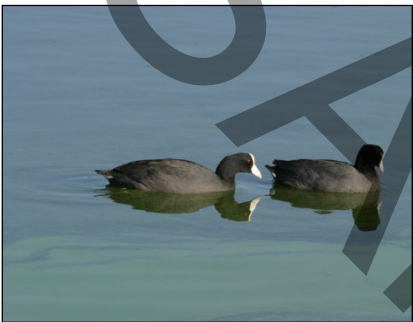
Hawaiian Coot - 'Alae ke'oke'o