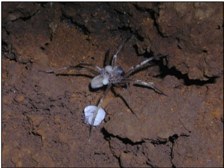
Kauai cave wolf spider