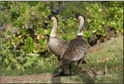
Nene – Hawaiian Goose