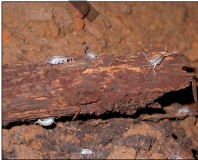
Kauai cave amphipod